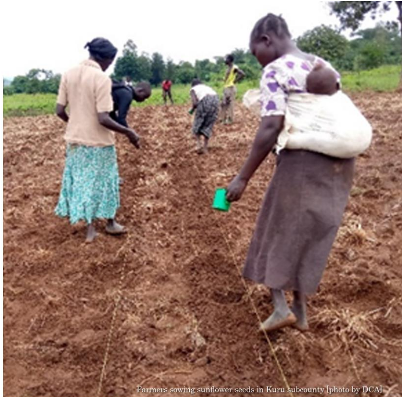
Farmers sowing sunflower seeds in Kuru subcounty

However, the story has since changed wherever a market has been established, additionally, a drainable toilet is built to ensure good hygiene and sanitation hence minimizing health risks among members of the community.