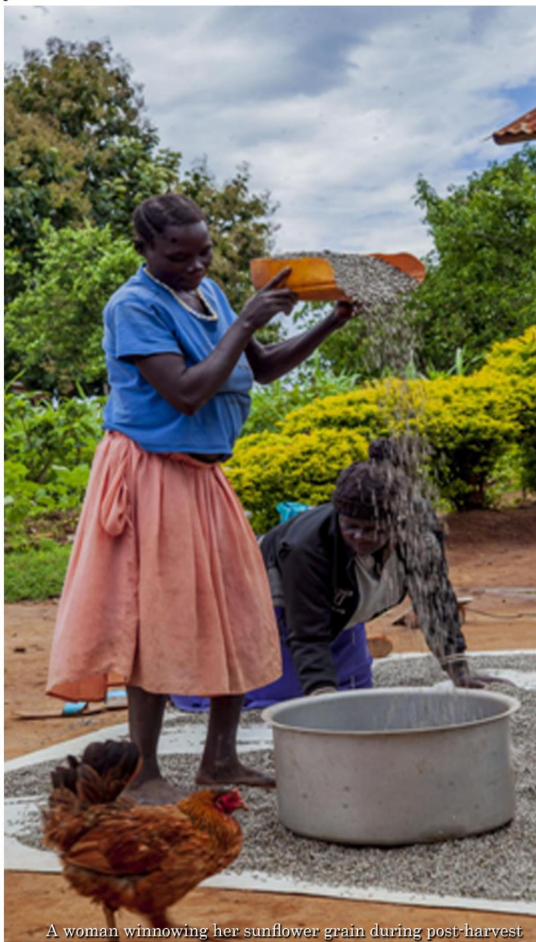
A woman winnowing her sunflower grain during post-harvest

He says the project has created social cohesion between locals in Yumbe and Koboko Districts as the sunflower market center often brings them together during times when Mukwano is on ground to buy.