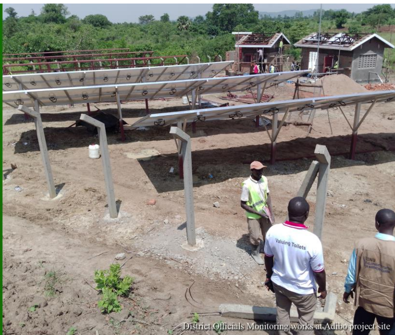
District Officials Monitoring works at Adibo project site