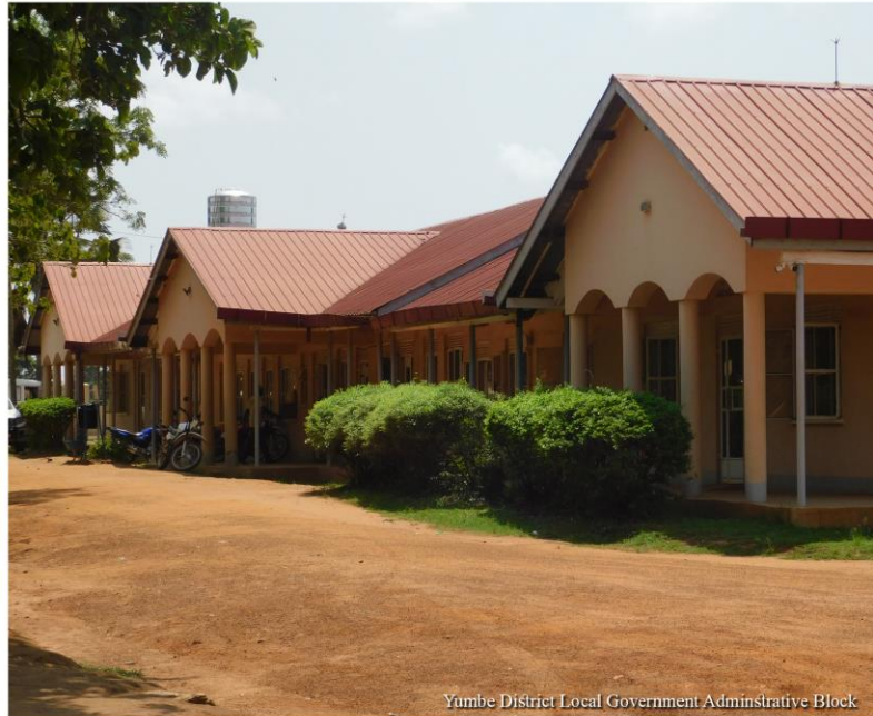
Yumbe District Local Government Administrative Block