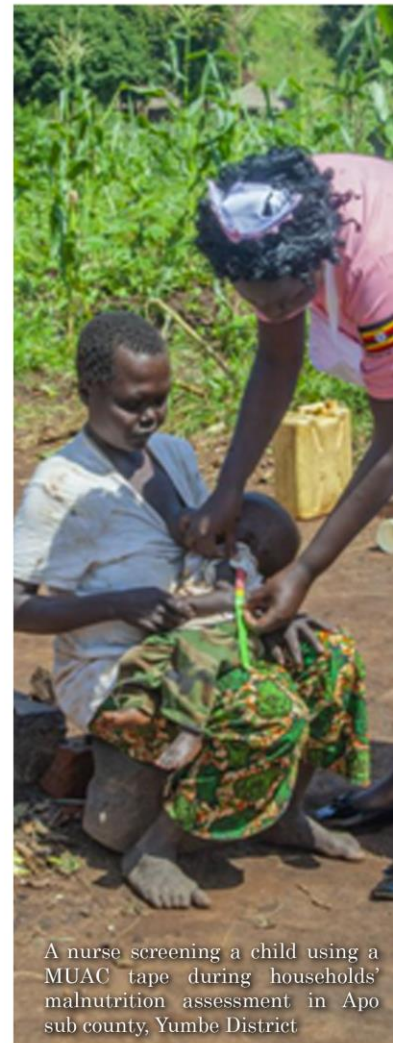
A nurse screening a child using a MUAC tape during households' malnutrition assessment in Apo sub county, Yumbe District