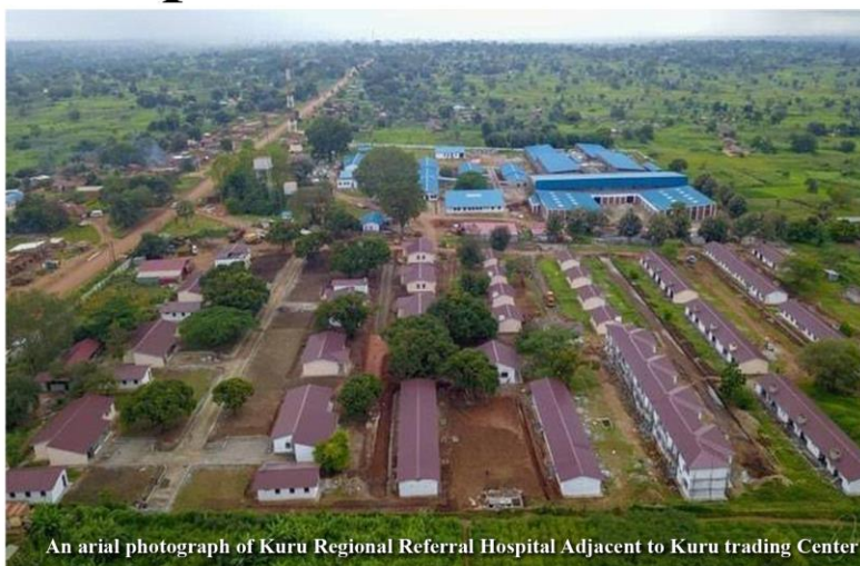
An aerial photograph of Kuru Regional Referral Hospital Adjacent to Kuru trading Center

Azabo however explains that, such a development is only achievable through continuity of donor support and strengthening areas where beneficiaries especially farmers still need more assistance. He argues that, much as there is tremendous success in areas of implementation and program goal achievement in Yumbe by 95%, there is still need for continued and expanded donor funding in order to boost chances of long term sustainability.