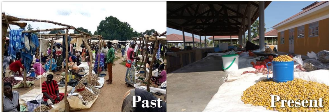
Vendors at Okubani market under the old structure on the left while on the right is the new structure constructed under DINU.